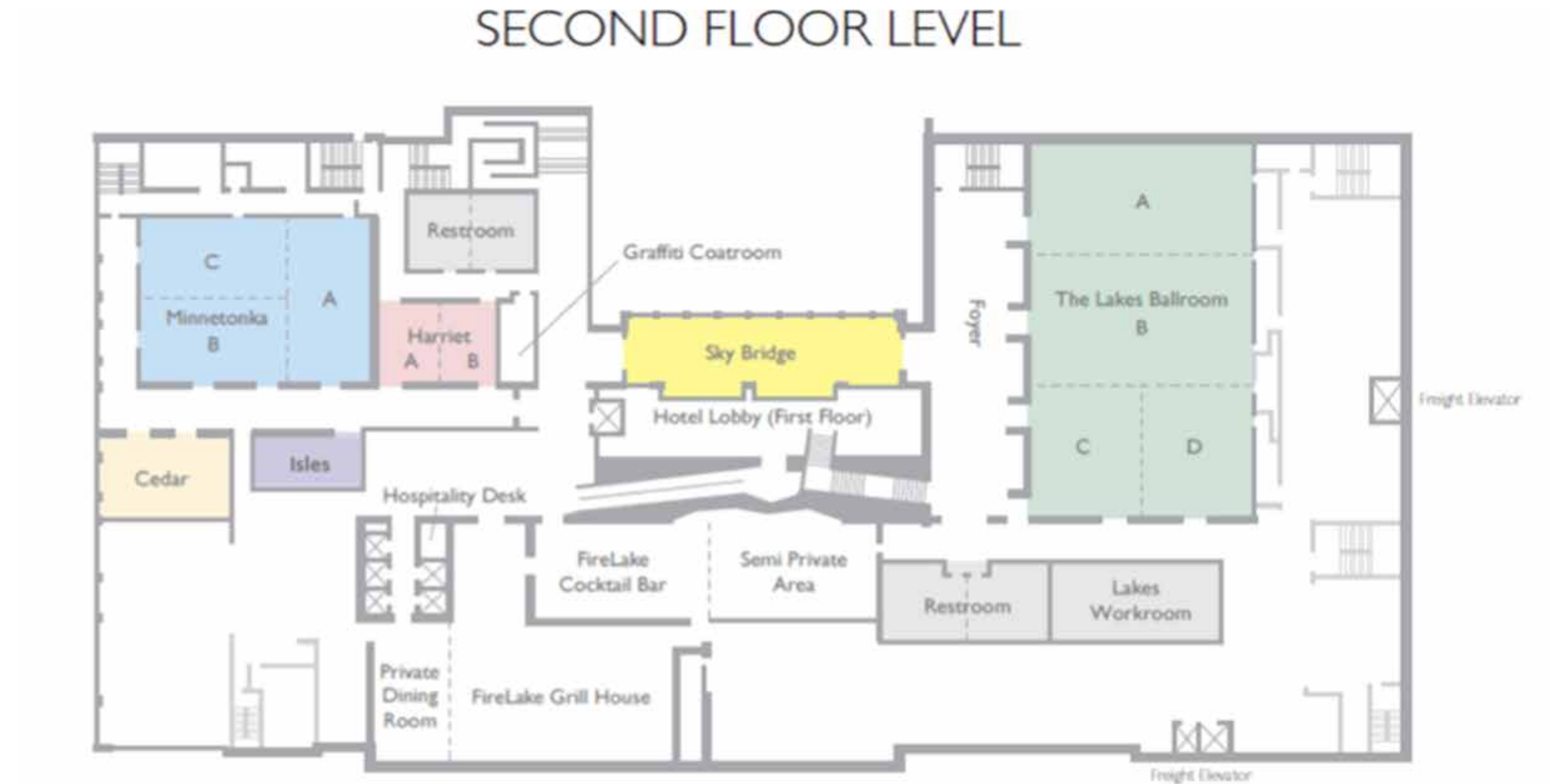
Exhibit Hall Floorplan